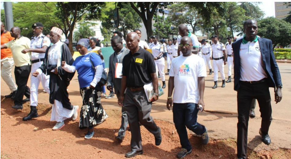
World Health Organizations' Dr.Hasifa Kasule, UPDN-ED and members of Inter religious council of Uganda during a march to the constitutional square