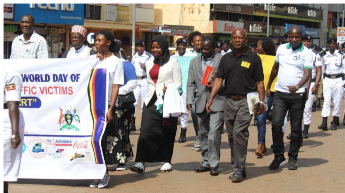
Members of inter religious council of Uganda during a march on Day of Remembrance for road traffic victims.