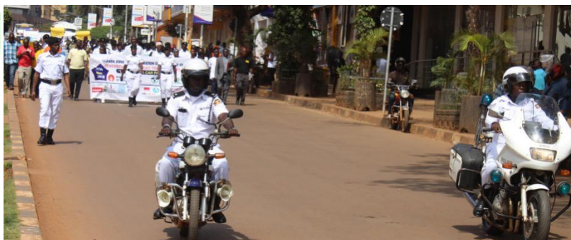
Uganda Traffic police take lead during the DOR procession