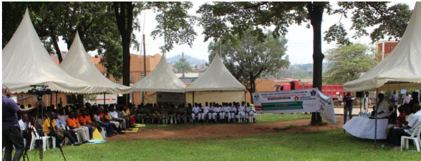
Traffic Police Officers and other stakeholders being addressed by Kampala Minister Beti Namisango Kamy.