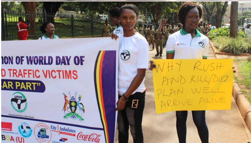
UPDN staff members on awareness campaign during World day of remembrance for Road Traffic Victims