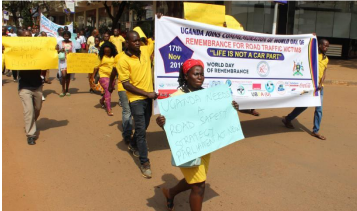
Driver association members participating in a road match advocating for road safety awareness through messages.