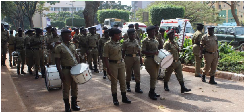
Uganda Police Brass Band leading the Day of Remembrances' march