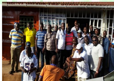
Group photo of community peers taken in Mbuya after a meeting