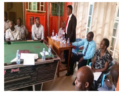
A stakeholders coordination meeting at Mbuya, the Mayor, DHO, NAFOPHANO, MARPS NETWORK attended in Mbuya in March