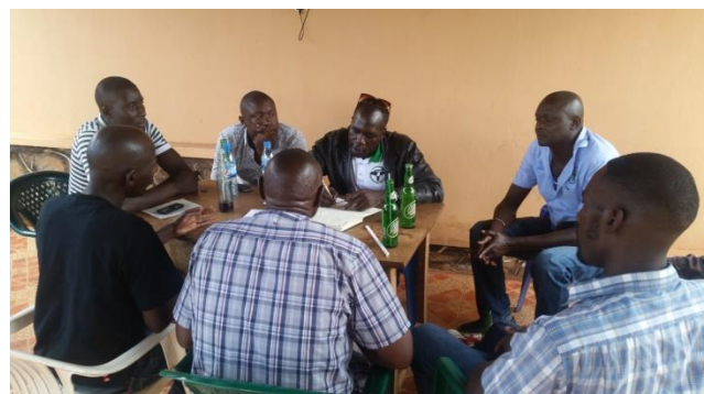
UPDN E.D meeting selected peers to discuss challenges and generate way forward for smooth peer operation

The team combined reported to have distributed two thousand five hundred sixty seven (2567) condoms in a period of six (6) months, two hundred and forty one (241) lubricants and referred two hundred and twenty four (224) truckers to different facilities for further management.