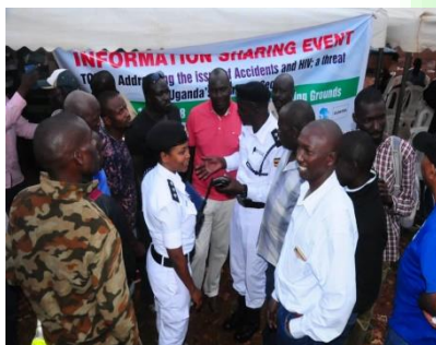
Stakeholders engagement meeting with Police and Truck Owner

In Natete Drop in Centre meeting was to discuss how the truckers can benefit from Drop In Centre programing; it was clear that truck drivers can access quality services from the DIC although there is strong need for concerted efforts to operationalize SOP that defines minimum package at these facilities to attract demand from the targeted truckers. Road safety being a health issue that our target community remains directly attached to; we organised a joint road safety and HIV outreach camp in Mbuya, where the traffic police also participated. This was intended to pilot our plan to integrate HIV programs into road safety and driver welfare.